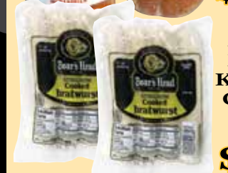
Boar's Head Bratwurst, Knockwurst, Or Smoked Sausage 15 oz. $4.99 pkg.