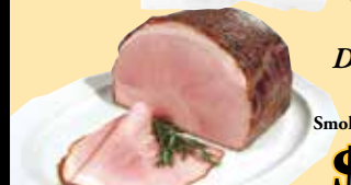
Dearborn Brand Ham Smokehouse Or Brown Sugar $5.99 lb.