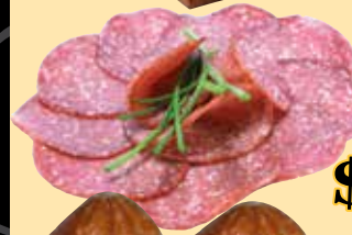
Hoffman's Hard Salami $4.99 lb.