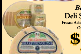
Bel Gioioso Deli Slicing Cheese Fresca Asiago, Fontina, Provolone, Or Peppercino $3.99 lb.