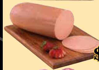
Kowalski Bologna Garlic Or Regular $3.99 lb.