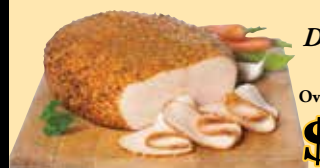
Dearborn Brand Turkey Oven Roasted Or Smoked $5.99 lb.