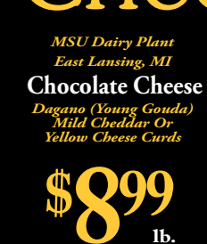
MSU Dairy Plant East Lansing, MI Chocolate Cheese Dagano (Young Gouda) Mild Cheddar Or Yellow Cheese Curds $8.99 lb.