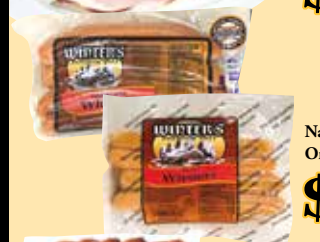
Winter's Wieners Natural Casing, Skinless Or Kielbasa - 2 Lb. Pkg. $3.99