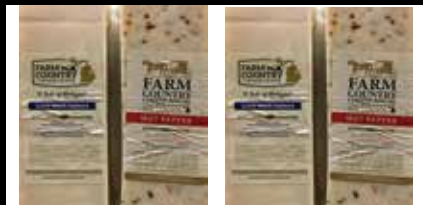
Farm Country Lakeview, MI Sharp White Cheddar Or Pepperjack