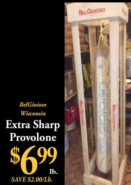
BelGioioso Wisconsin Extra Sharp Provolone $6.99 lb. SAVE $2.00/Lb.