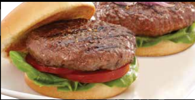
USDA Choice Ground Beef From Chuck Ground Several Times Daily!