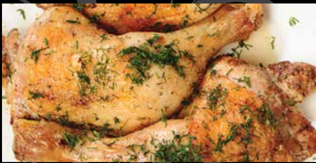
Whole Chicken Legs NO Backs