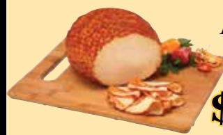
Boar's Head Chipotle Chicken $8.99 lb.

New At Cantoro's - Boar's Head Deli Items!