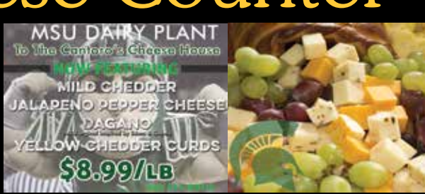
MSU DAIRY PLANT To The Cantoro's Cheese House NOW FEATURING MILD CHEDDAR JALAPENO PEPPER CHEESE DAGANO YELLOW CHEDDAR CURDS $8.99/LB