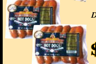
Dearborn Brand 1904 Hot Dogs $4.99 pkg.