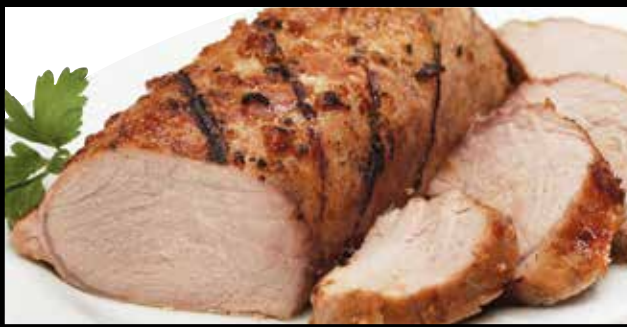
USDA Inspected Pork Tenderloin