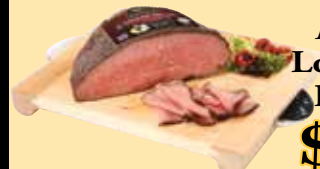
Boar's Head London Broil Roast Beef $9.99 lb.