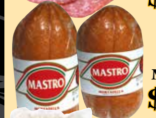
Mastro Mortadella $4.99 lb.