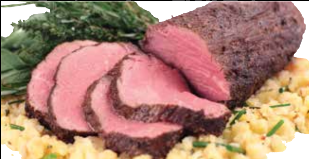
USDA Beef Tenderloin