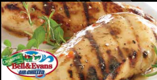
Bell & Evans Boneless Skinless Chicken Breast