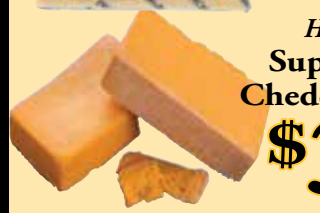
Hoffman's Super Sharp Cheddar Cheese $3.99 lb.